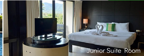
Junior Suite Room