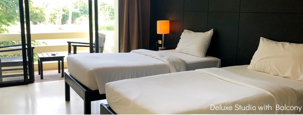
Deluxe Studio with Balcony